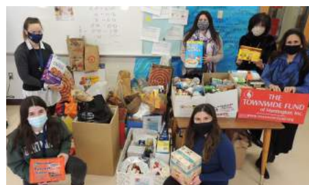
Our local CSH students sending messages of hope to our elderly and our military