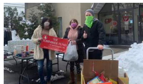
Volunteers ensuring our food pantries like Helping Hands Mission are well stocked