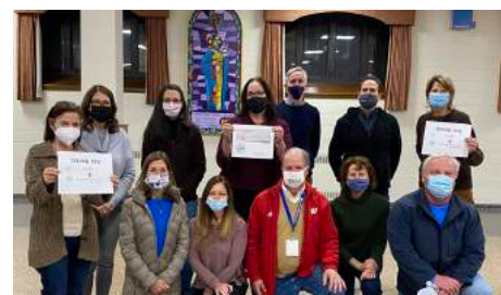
Grant to Society of St Vincent de Paul to help care for those who have fallen on hard times