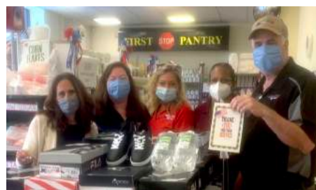
Volunteers handing out supplies for veterans in need with General Needs at LI Cares